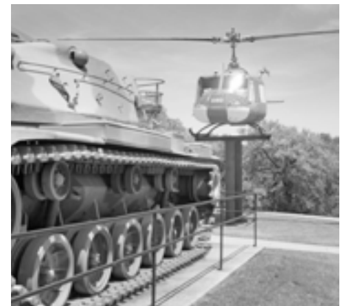
Below: M4A3 Sherman Tank.