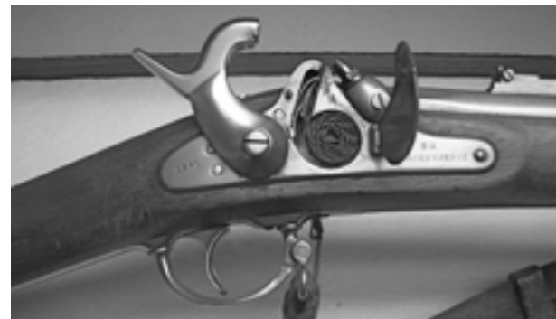
Maynard Tape Primer.