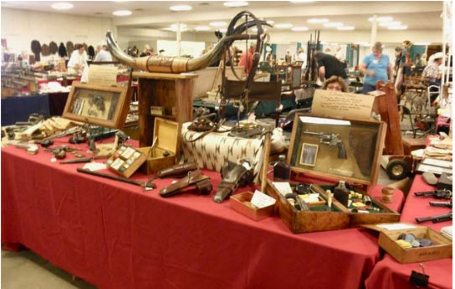
There is Something for Everyone at the Old West and Military Collectible Show