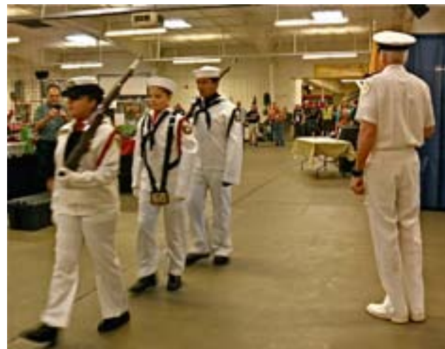
Color Guard at the October Show